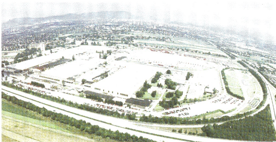
The works areas of Steyr-Daimler-Puch Fahrzeugtechnik AG

Consultants & Agents to Steyr Daimler Puch Fahrzeugtechnik